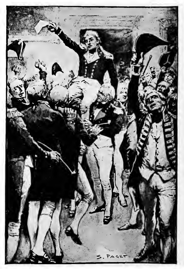
THEY SHOUTED AND STAMPED AND RAVED IN THEIR DELIGHT.